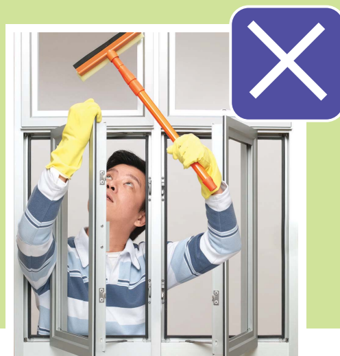
不要用窗扇「借力」 Do not impose additional load on window sashes