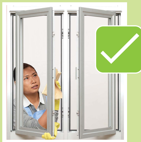
抹窗須小心 Exercise caution when cleaning