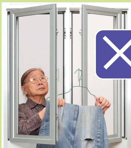
不要將物件掛在窗上 Do not hang any object on window sashes