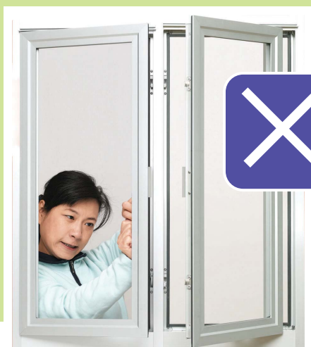
不要強行打開窗門 Do not force open a window